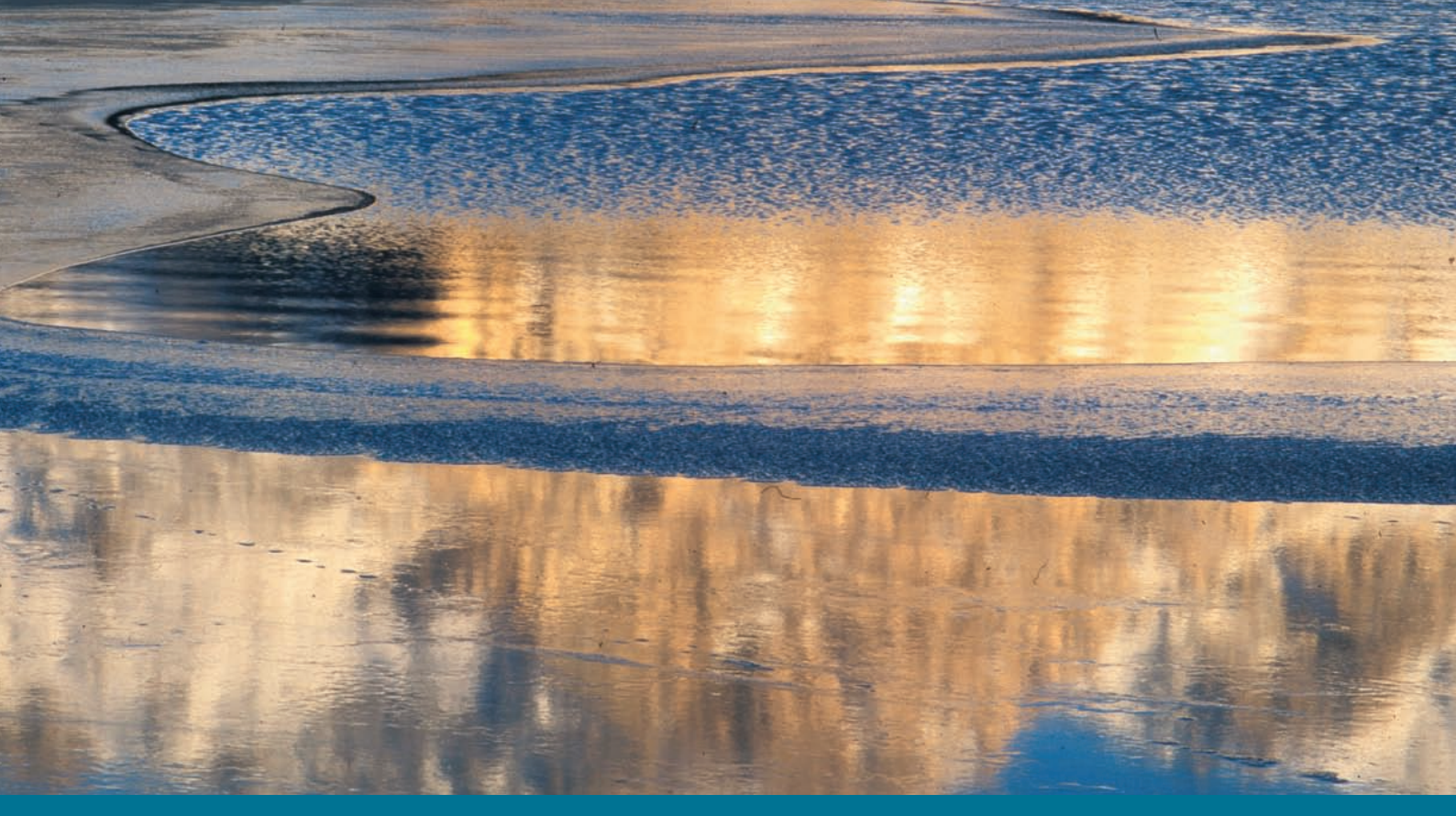
Landscape, our inmost selves reflected