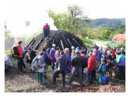
Heritage walk

The Slovenian Network of NGOs for the interpretation of Heritage (SMID) is based on a new concept of networking, inspired by the principles of the Faro Convention. Each partner generates a local network of "heritage communities". The members of these communities are trained to be able to apply for national and international tenders and to run their own business around the interpretation of heritage. As a result, the number of quality heritage projects is increasing and, what is even more encouraging, a growing number of people who have had training are joining the regional development boards where they can promote heritage as an asset for local development and thus participate in drawing up innovative development strategies.