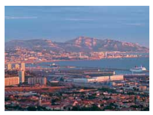
The town of Marseille

Elected representatives from the 2nd, 7th, and 8th districts of Marseille and the Mayor of Vitrolles are endorsing the principles stated in the Faro Framework Convention in order to give a European dimension to the local social initiatives. Tenants' associations, groups of enterprises, associations, artists' collectives, or ordinary citizens have initiated these "heritageled" projects which emphasise the environment and the quality of life in neighbourhoods. Some of the initiatives have enabled projects to be set up as part of the Marseille-Provence 2013 European Capital of Culture. The experience in Marseille has inspired similar initiatives in other European cities, such as Venice (Italy) or Košice (Slovak Republic).